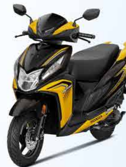
PEARL SPORTS YELLOW